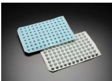
Round Well Molded Liner