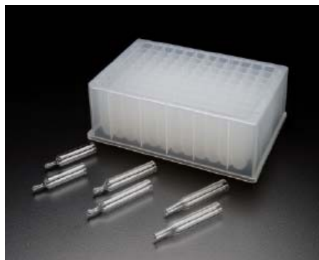
System uses 96 glass tapered inserts in a 96-square deep well plate.

An ideal solution for sample storage, reactive chemistry and biological testing.